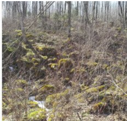
Boulder field on South Slope of Summit Lake Moraine east of Baker Lake