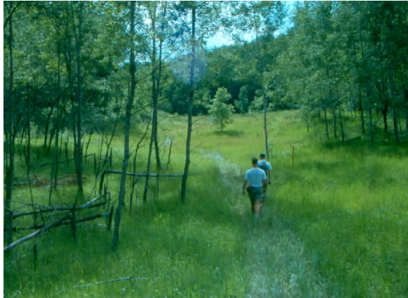
Frostpocket on the Kettlebowl Segment

"You Are Here" signs, installed in 1997, are at select sites or where the trail crosses public roads on the Kettlebowl, Lumbercamp, Old Railroad and Parrish Hills segments.