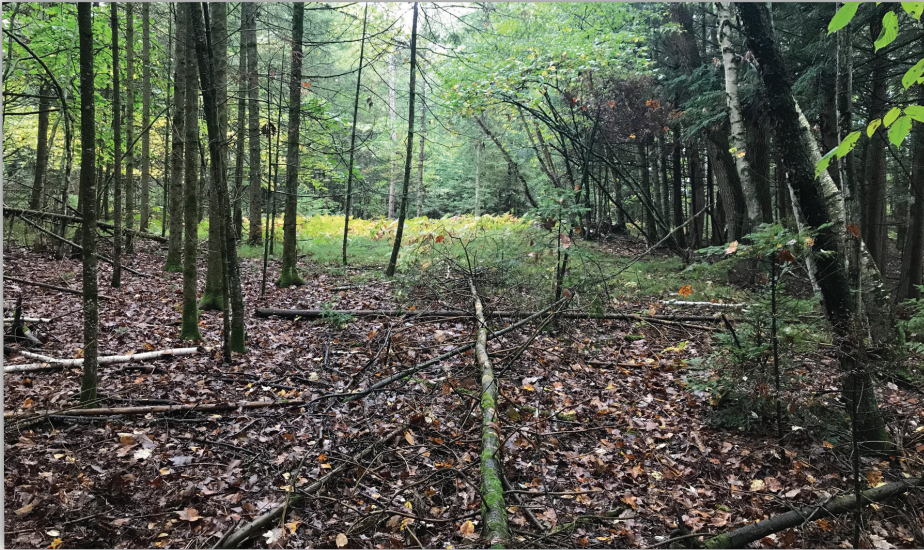
A peek into new territory now part of the 22.7-acre Rice Lake Preserve expansion.