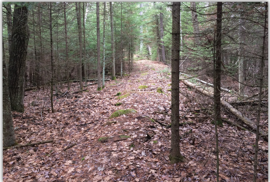
The view of the high ridge that runs along the banks of the Rice Lake Creek.